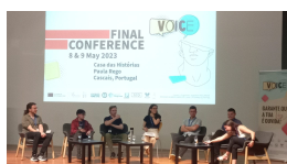
Portugal: VOICE Action Conference in